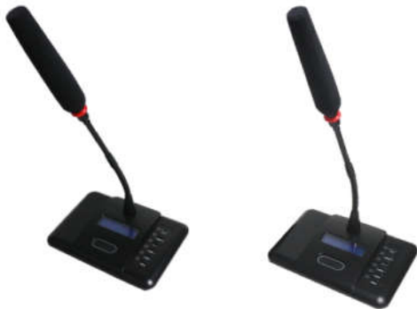
DC-800CS Chairman Unit