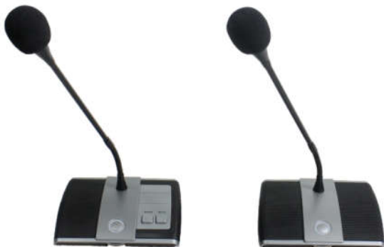
DC-800C Chairman Unit