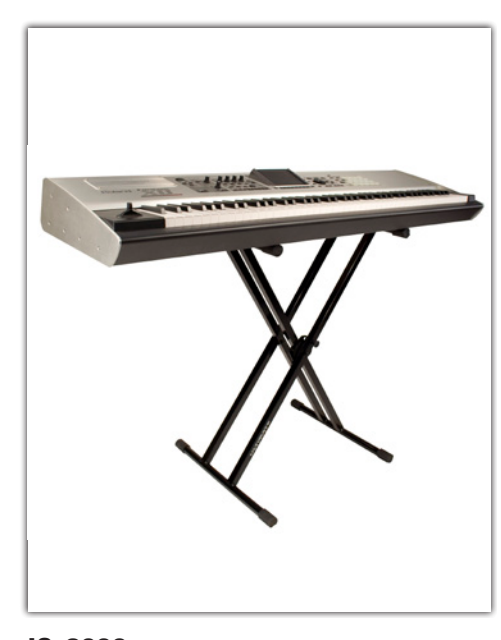
IQ-2000 Double Brace X-Stand