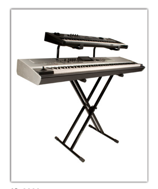
IQ-2200 Signal Brace X-Stand with Second Tier