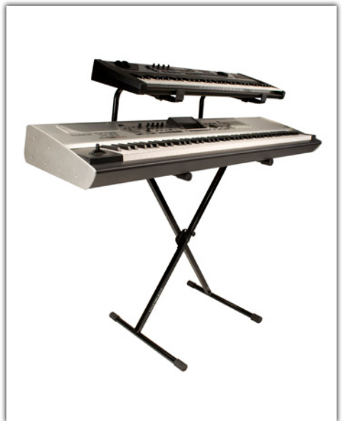
IQ-1200 Signal Brace X-Stand with Second Tier