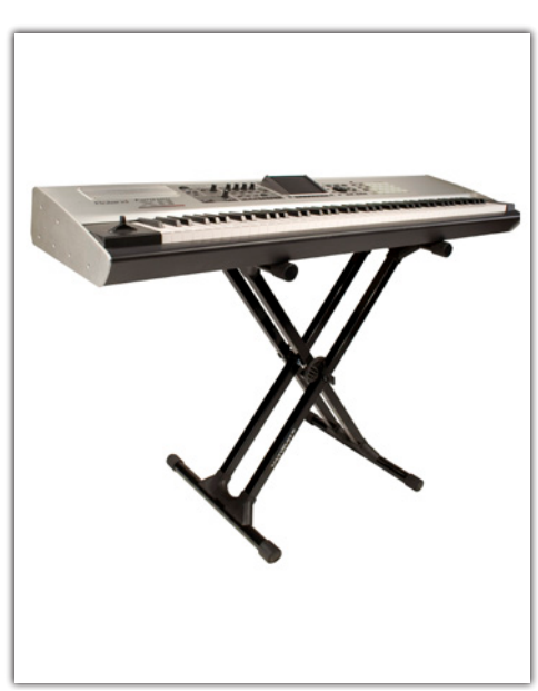
IQ-3000 Reinforced Double Brace X-Stand