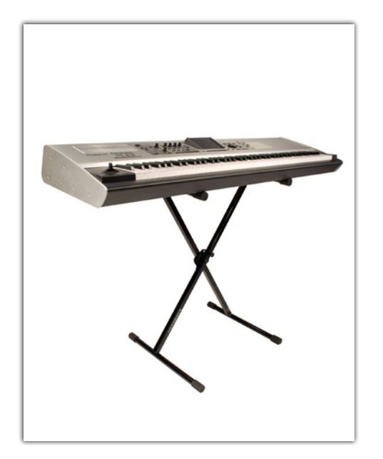
IQ-1000 Signal Brace X-Stand

The IQ Series redefines the X-style keyboard stand, bringing a new level of stability and innovation to the lightweight, gigging-minded design. Offering a range of height settings for sitting-to-standing playing comfort, the IQ-1000, IQ-1200, IQ-2000, IQ-2200 and IQ-3000 all feature Ultimate Support's patented Memory Lock system and unique stabilizing end caps, giving keyboardists timesaving onstage luxuries along with peace of mind. IQ Series stands hold true to Ultimate Support's twofold commitment – providing uncompromising instrument stability while remaining at the forefront of musician-centric, innovative design – and are ideal for supporting everything from lightweight synthesizers and MIDI controllers to the heaviest of professional keyboard workstations.