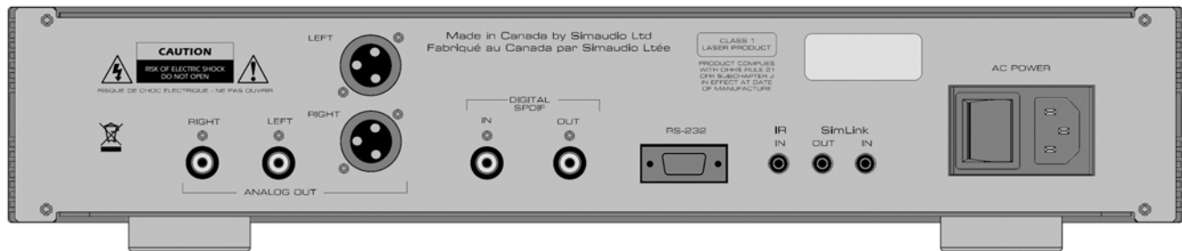
Figure 2: MOON CD 3.3 Rear panel with optional balanced analog outputs

The rear panel will look similar to Figure 2 (above). On the left side is the analog audio output. There is one pair of RCA analog audio output connectors labeled “ANALOG OUT” that you should connect to a stereo analog input on your preamplifier or integrated amplifier.