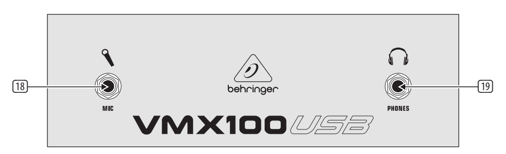
Fig. 2.1 Front view of the PRO MIXER VMX100USB