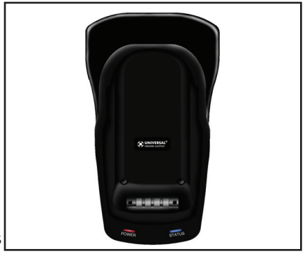
Red indicates charging, Blue that the remote is fully charged.

The Status light should immediately light. Red indicates that it is charging. Blue shows that it is fully charged. There is no harm in leaving the MX-5000 on its charging base whenever it is not in use.