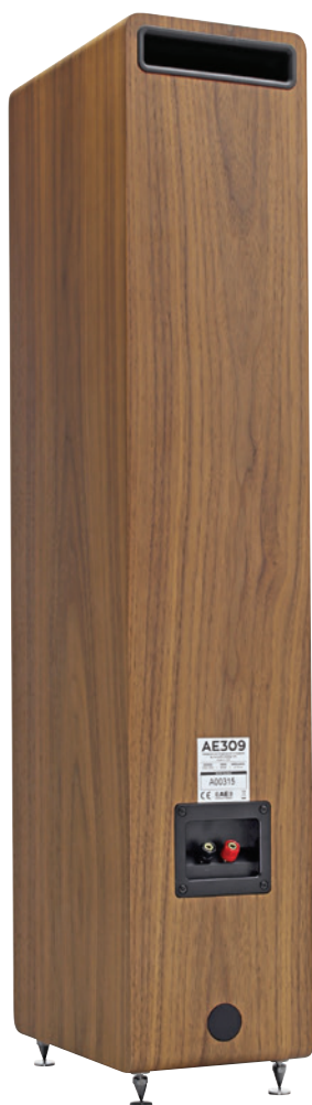
Veneered all round, a slot reflex port at top and a mass loading port at bottom.

thought it was an artificial veneer. Oh sad. But it is well applied for a smooth edge finish and full coverage, including the rear panel. There are gloss black and white finish alternatives.