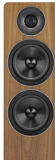
A 25mm aluminium tweeter at top and bass/midrange plus bass-only unit below.

In all, the '309s are exciting loudspeakers that give a full-on musical experience, with no attempt to smother the truth. Well worth hearing, especially if you love fast Rock.