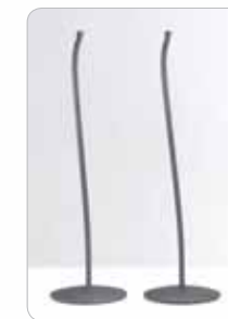
ST-95 stand matches the SP-1 satellite speaker

The MT-1 Compact is a great super minimalistic designed HT solution. Incorporating the new PSW150ew fitted with a 7" shallow, reflex loaded active subwoofer driven by a high quality BASH™ amplifier (150W) with desirable HT features. Both subwoofers delivers a dynamic and rich home theatre experience and seamlessly integrate with Morel's SoundSpot™ series.