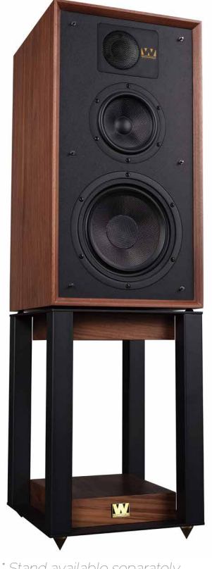
* Stand available separately

CONFIDENTIAL. SHARED UNDER NDA. NOT FOR PUBLIC DOMAIN.