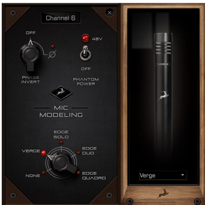
Verge Mic Emulations Window

Verge is a small-diaphragm condenser microphone that's as simple to use as the Edge Solo. Its dimensions and ability to handle high sound pressure levels make it a better fit for positioning in tight spaces and recording very loud sources, such as drum kits.