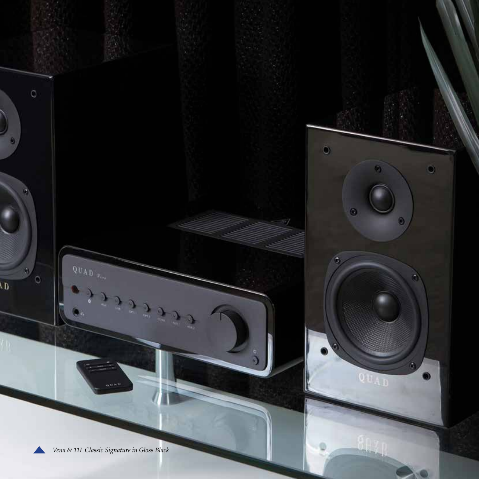
▲ Vena & 11L Classic Signature in Gloss Black