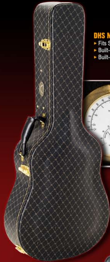
DHS MADISON ► Fits Standard Dreadnaught ► Built-in Thermometer ► Built-in Hygrometer