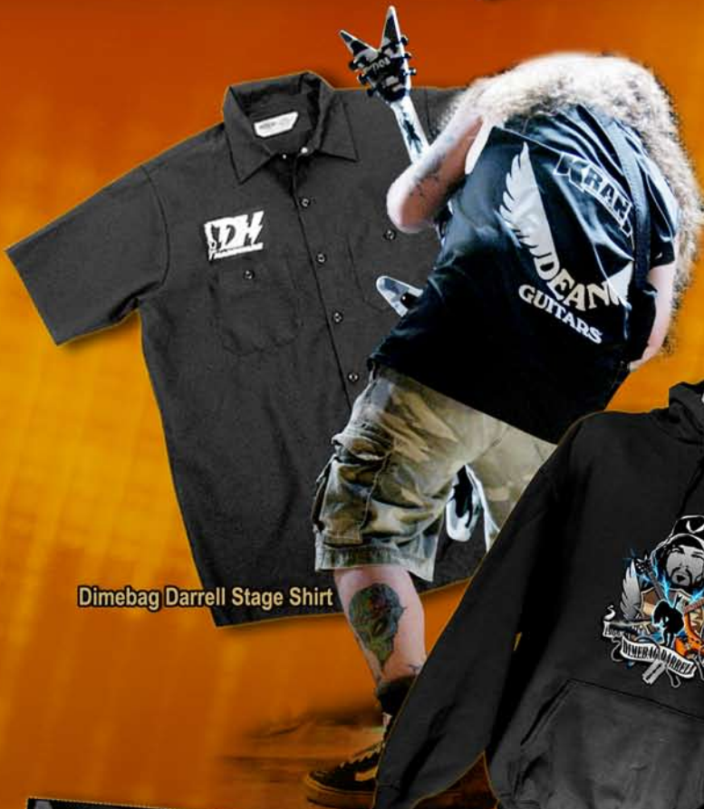
Dimebag Darrell Stage Shirt