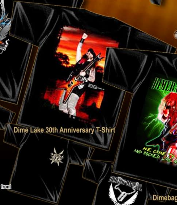
Dime Lake 30th Anniversary T-Shirt