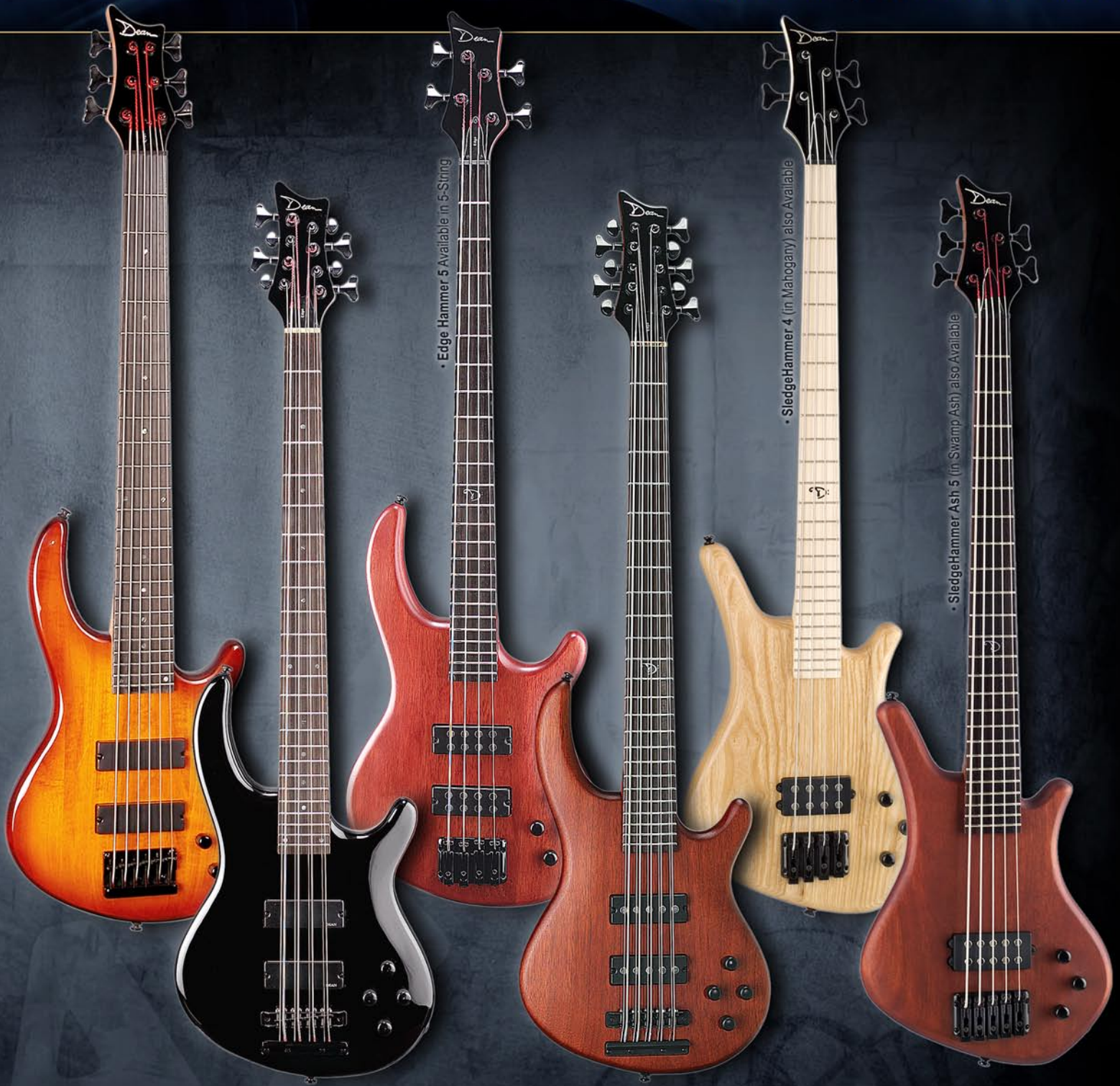
• Edge Hammer 5 Available in 5-String