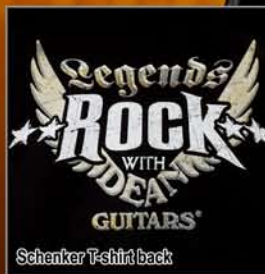
Schenker T-shirt back