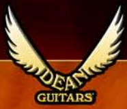
Dean Wings T-Shirt