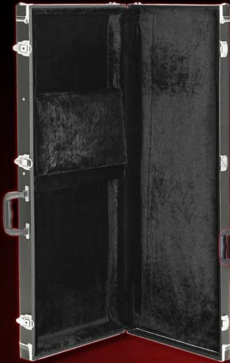
HARD SHELL CASES ► Various Sizes Available