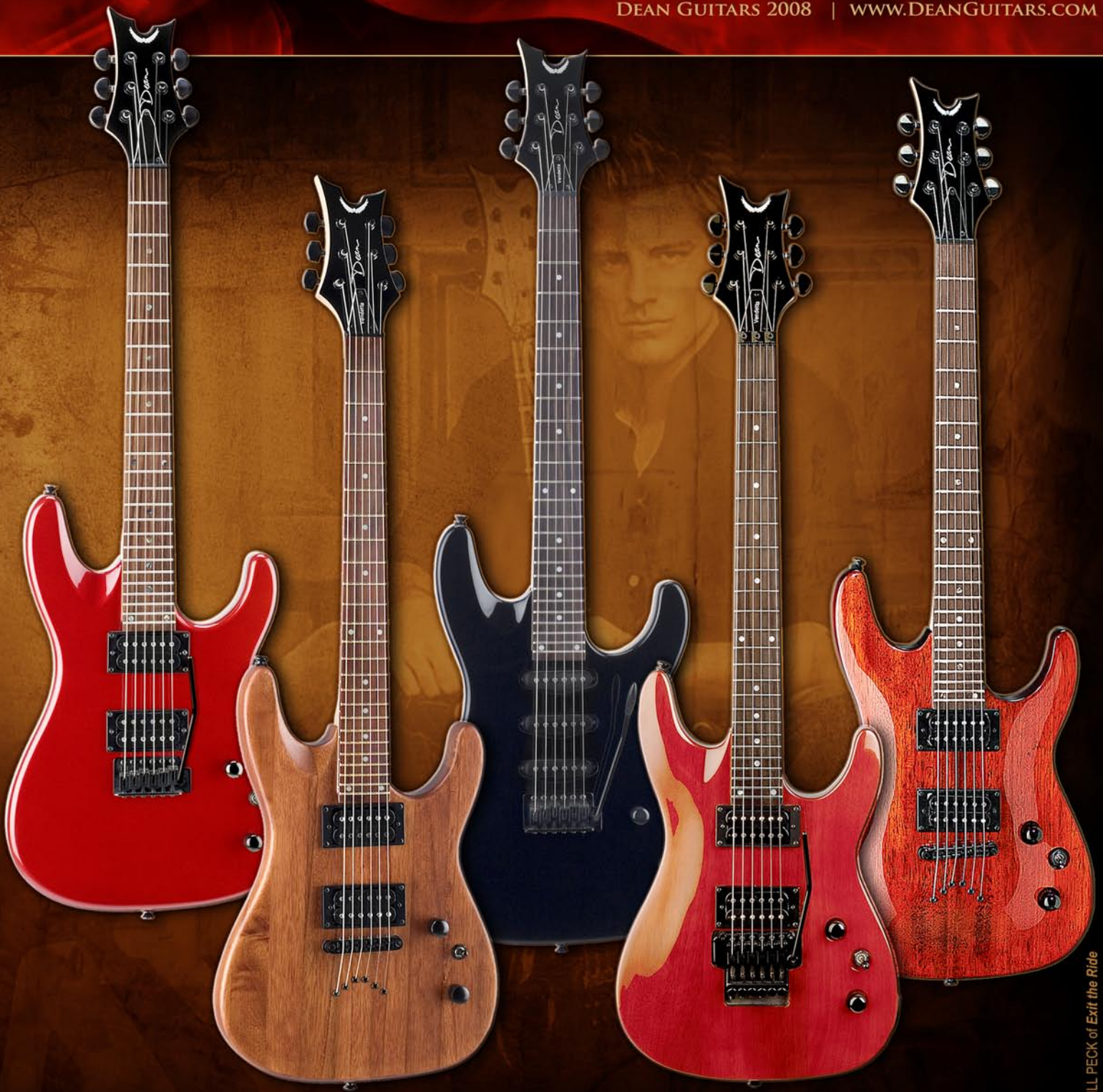
BILL PECK of Exit the Ride