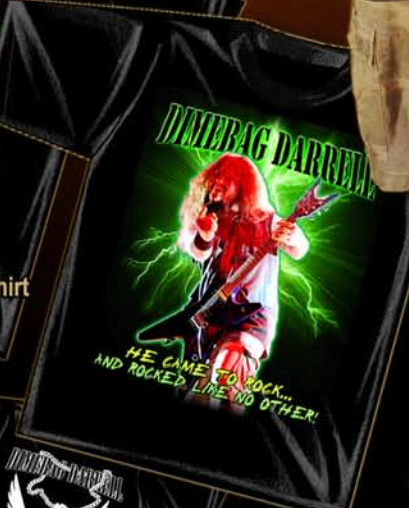
Dimebag "He Came to Rock" T-Shirt