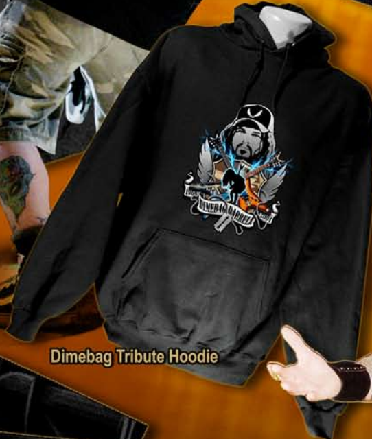
Dimebag Tribute Hoodie