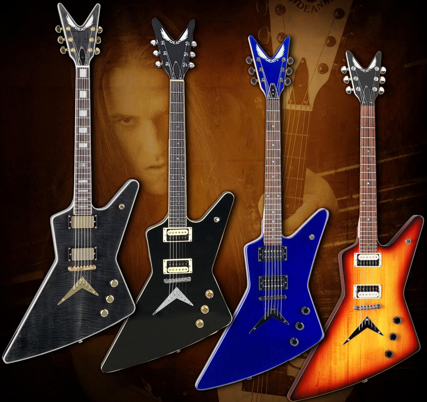
ADAM ZADEL of Soil