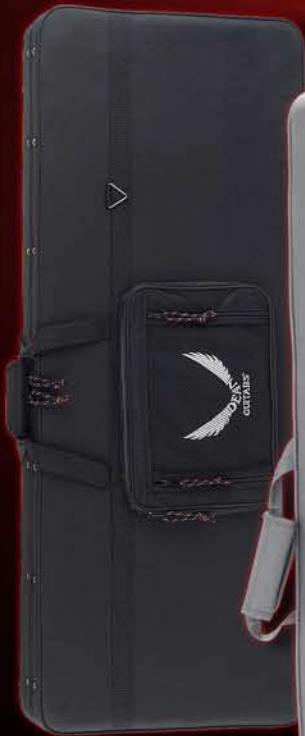
LITE LEER CASES ► Various Sizes Available