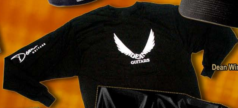
Dean Wings Long Sleeve