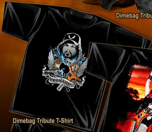
Dimebag Tribute T-Shirt