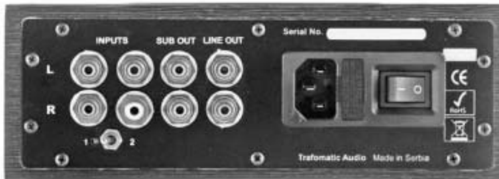
Figure 3: Experience Head One back panel

Make sure your amplifier is properly connected to a high-current power receptacle.