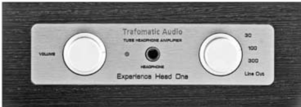
Figure 2: Experience Head One Front panel